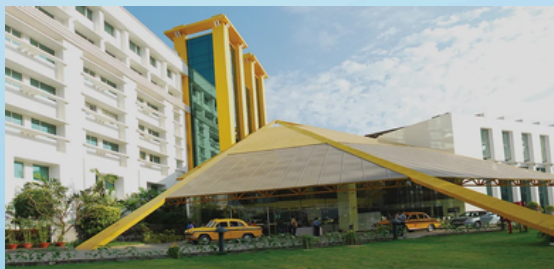
MEDICA SUPERSPECIALITY HOSPITAL (KOLKATA)