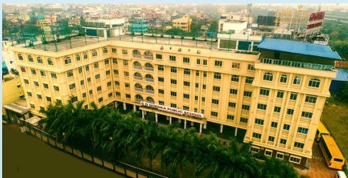
GD GOENKA SCHOOL (KOLKATA)