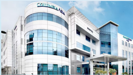
COLOUMBIA ASIA (KOLKATA)