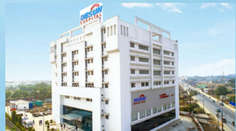
DESUN HOSPITAL (KOLKATA)