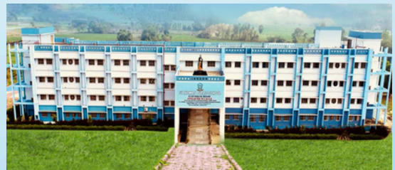
ST. THOMAS PUBLIC SCHOOL (HOOGHLY)