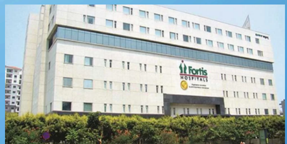
FORTIS HOSPITAL (KOLKATA)