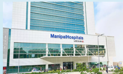
MANIPAL HOSPITAL (KOLKATA)